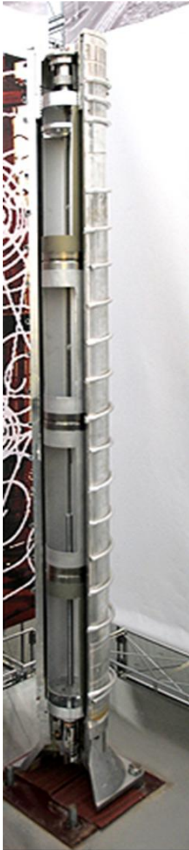
Figure 2: Cutaway Model of the IR-1 Centrifuge and a P-1 Rotor Assembly