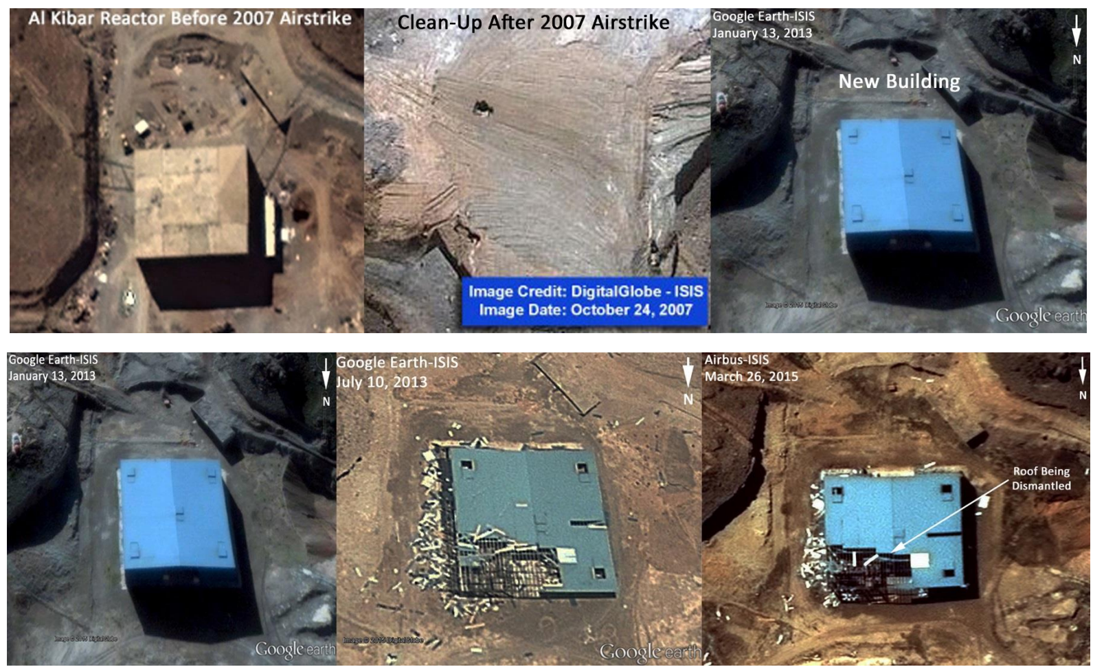
Figure 2. the Al Kibar reactor building before the 2007 airstrike (top left), the building that was built after the airstrike (top right), and the dismantlement efforts between July 2013 and March 2015 (bottom images).