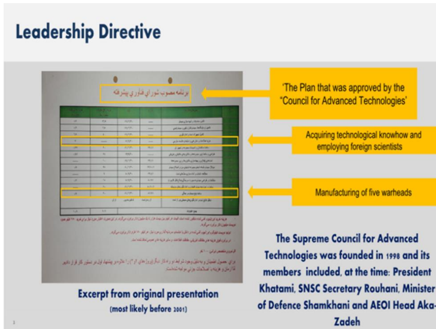
Figure 2. Slide from Prime Minister’s Netanyahu’s presentation, April 30, 2018, showing a partially translated Iranian timetable from the archive.

The manufacturing of five explosive systems, of which four would be “warhead systems,” required almost one fifth of the budget represented in the approved plan. The tasks in this table track with more formal projects listed in later documents, when the program was further along in terms of planning and implementation.