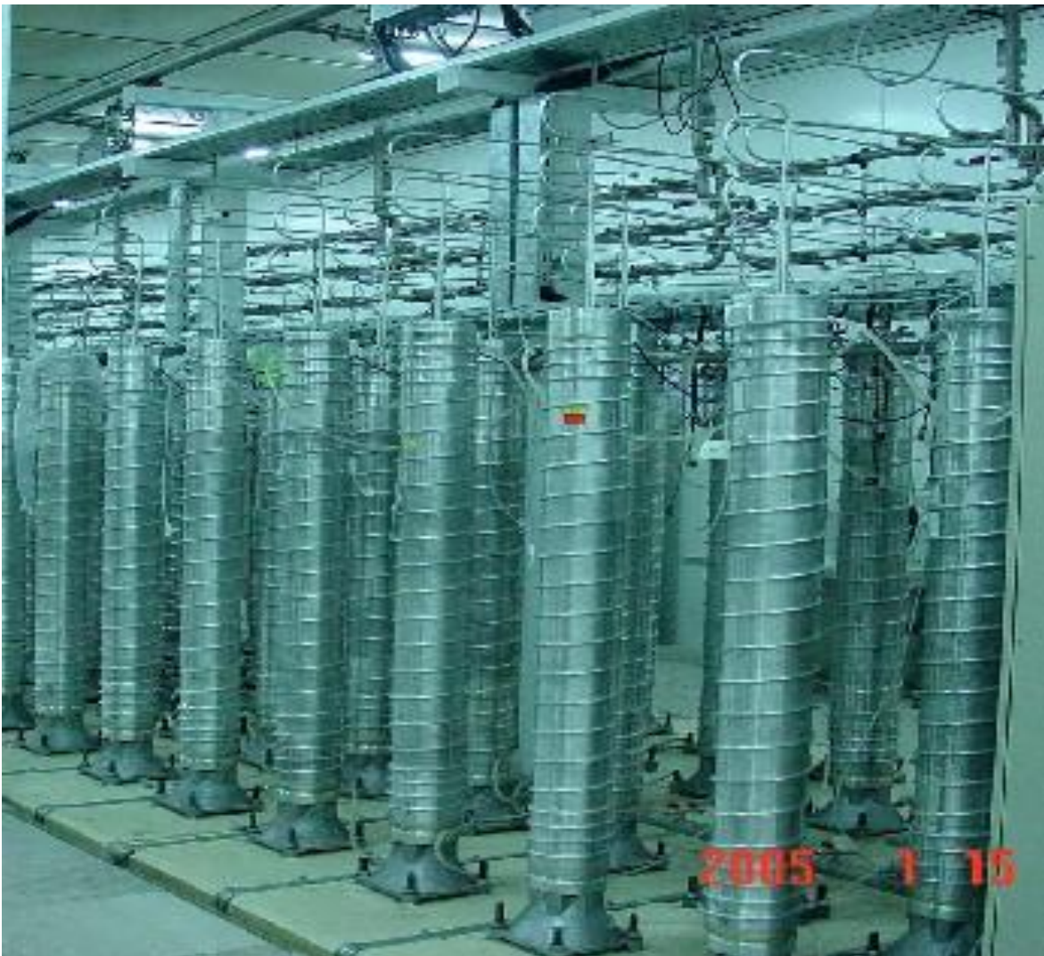
Figure 2, IR-1 cascade in the Natanz Pilot Fuel Plant, showing the pipework above the centrifuge.