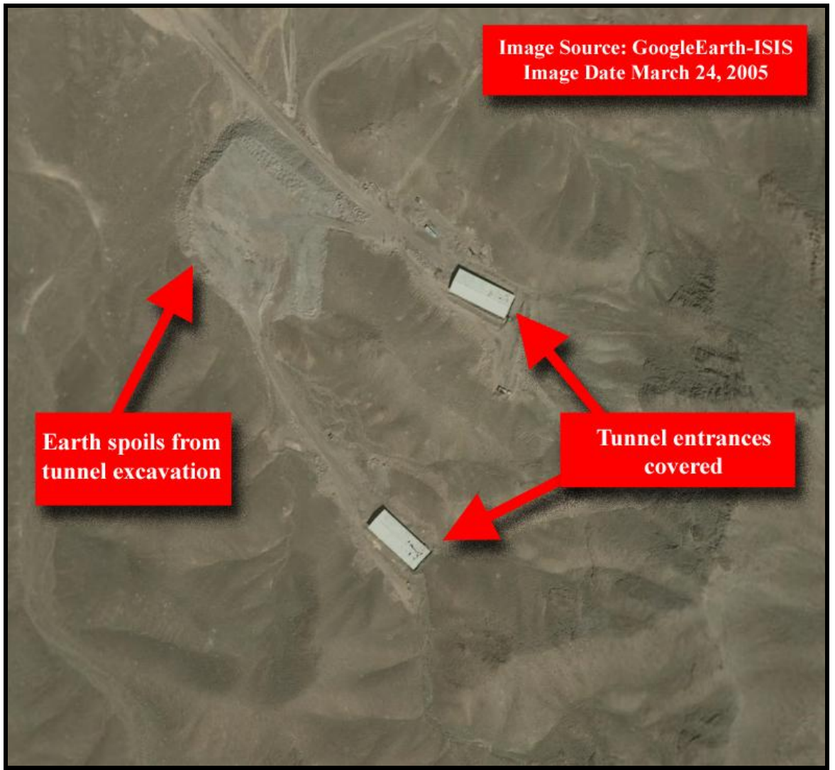
Figure 2. GoogleEarth image from March 24, 2005. The same two covered tunnel entrances can be seen, as well as the pile of earth spoils. There does not appear to be much progress at this site between June of 2004 and March of 2005.