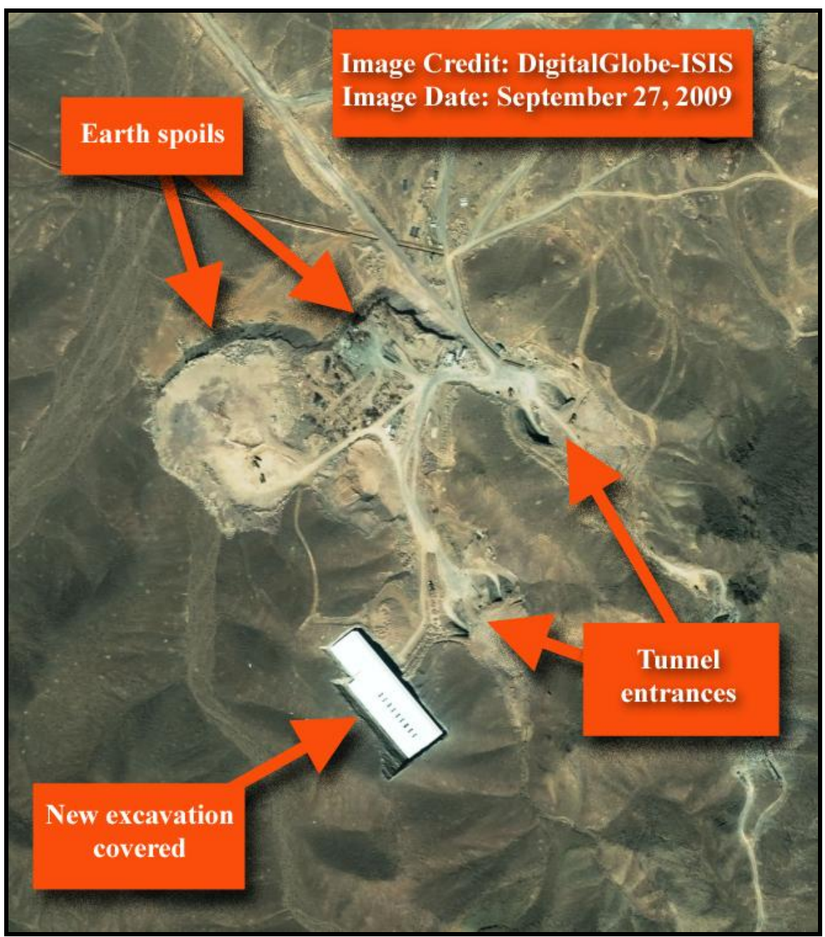
Figure 4. DigitalGlobe image from September 27, 2009 of the same site. The new excavation has been covered, as have the original two tunnel entrances.