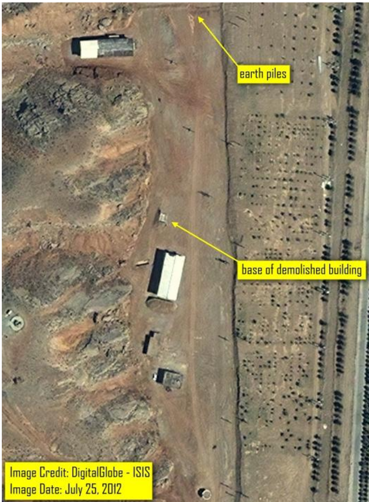
Figure 2. Satellite image from July 25, 2012 showing the results of extensive alterations undertaken at the suspected high explosives testing site, including the demolition of two buildings and major earth displacement activities.