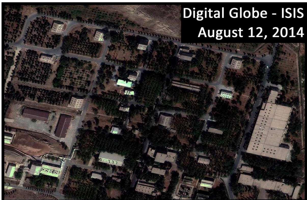
Digital Globe - ISIS August 12, 2014