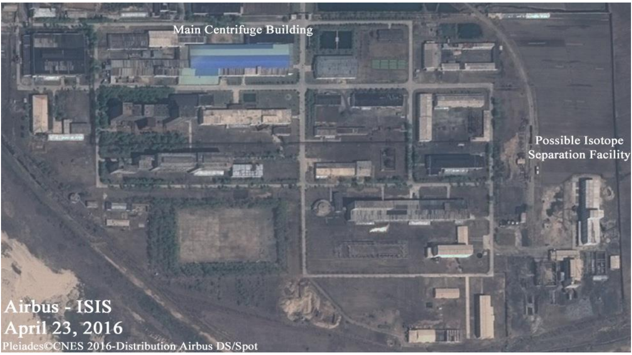
Figure 5. Airbus imagery showing North Korea's fuel fabrication facility and centrifuge enrichment building on April 23, 2016.