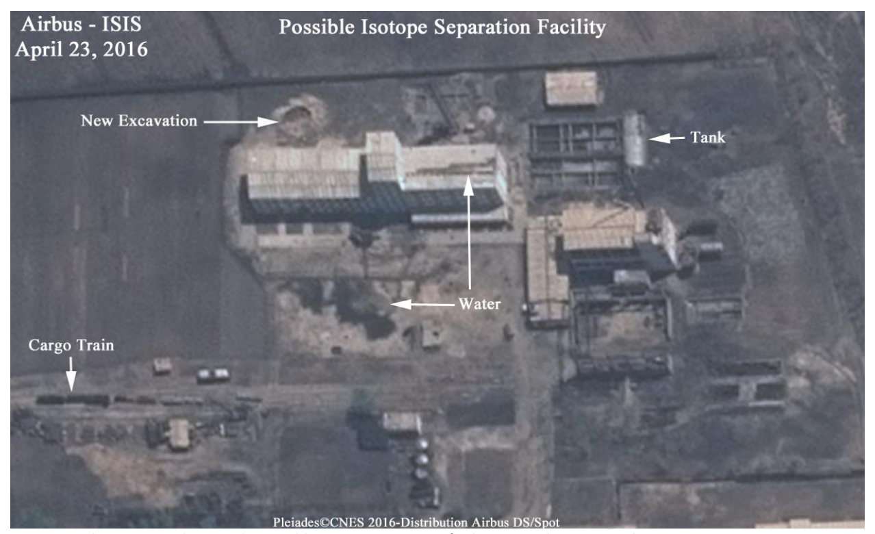
Figure 4. Airbus imagery showing the possible isotope separation facility at Yongbyon on April 23, 2016.