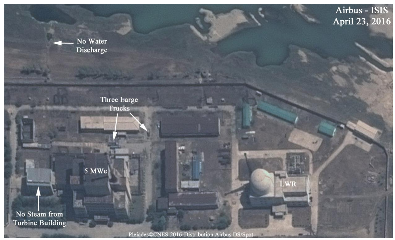
Figure 1. Airbus imagery showing North Korea's 5 MWe and LWR reactors on April 23, 2016.