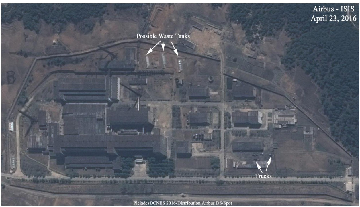
Figure 2. Airbus imagery showing North Korea's Radiochemical Laboratory on April 23, 2016.