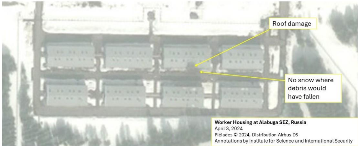
Figure 3. An Airbus Pleiades satellite image from April 3, 2024, showing damage to the roof of one building in the dormitory complex.