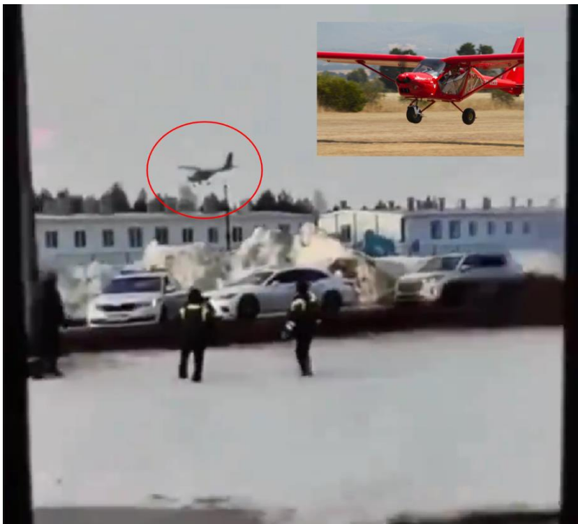
Figure 2. A snapshot from a video of the attack showing the aircraft and a comparison to an Aeroprakt-22, taken from Aeroprakt Aircraft's website. 3