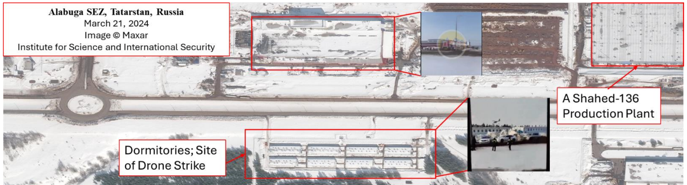
Figure 6. Ground photos from the attack are correlated with a satellite image pre-dating the attack to confirm that the drone struck the dormitories. 10