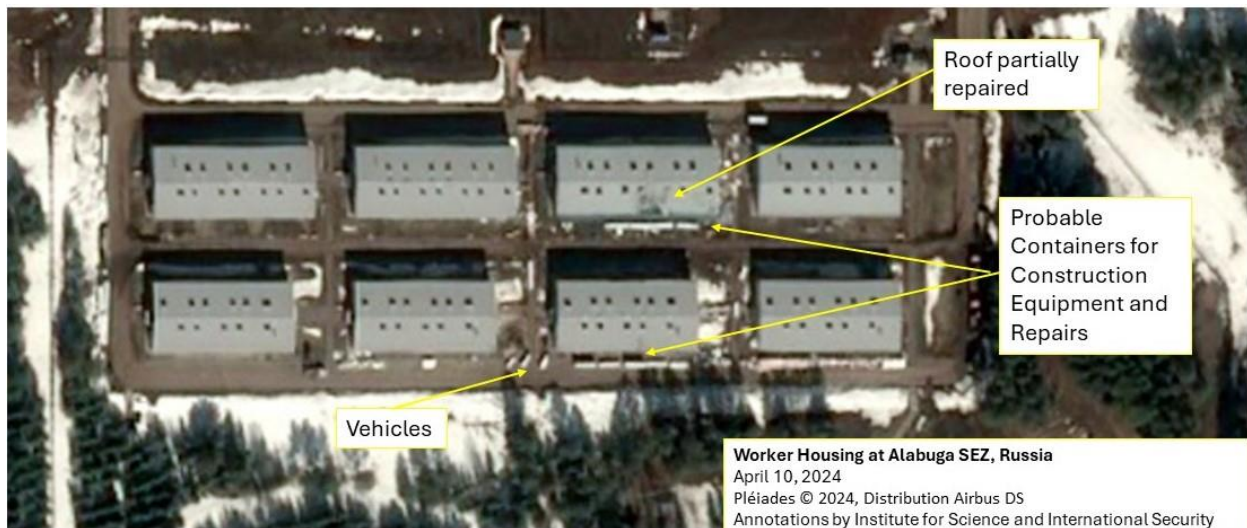
Figure 4. An Airbus Pleiades satellite image from April 10, 2024, showing the repair work being done at the dormitory complex.

Based on the available footage, the aircraft used in the Alabuga strike appears to be an Aeroprakt-22, modified to be remotely controlled and laden with explosives (see Figure 2). Aeroprakt-22's are typically used as training aircraft. Its two-seated airframe enables the aircraft to carry a large explosive charge. The aircraft typically has a range of roughly 1,100 km (roughly 684 miles), beyond the range of the Alabuga SEZ from Eastern Ukraine. It is unclear where the aircraft was launched from, and whether it had additional modifications that enabled it to travel the great distance. Several possibilities exist for how the drone got to Alabuga. A drone launched from Ukraine would require additional fuel supplies and need to navigate the great distance through Russian controlled airspace undetected by air defenses. Additional fuel supplies would reduce the weight availability for explosives. If the aircraft was launched from