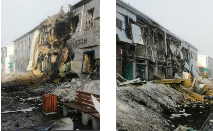
Figure 1. Ground images of the aftermath of the drone strike on the Polytechnic dormitories at Alabuga SEZ on April 2, 2024, posted on social media. 2