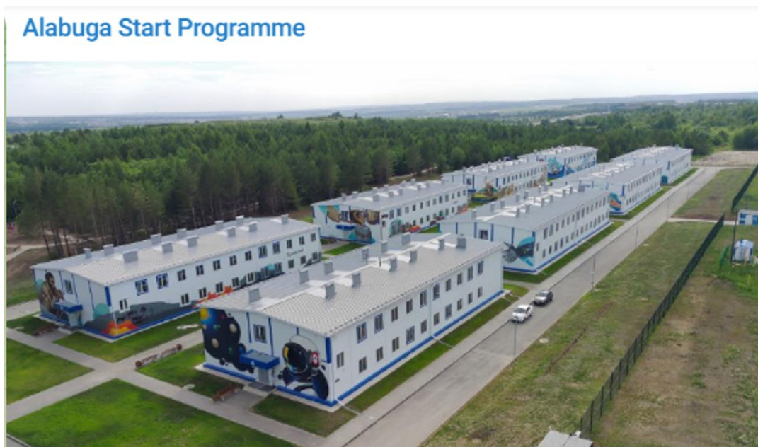
Figure 7. A Telegram post by Alabuga Start, the program operated by Alabuga Polytechnic University, showing the dormitories that house its participants. The buildings are the same seen in videos of the attack. 11