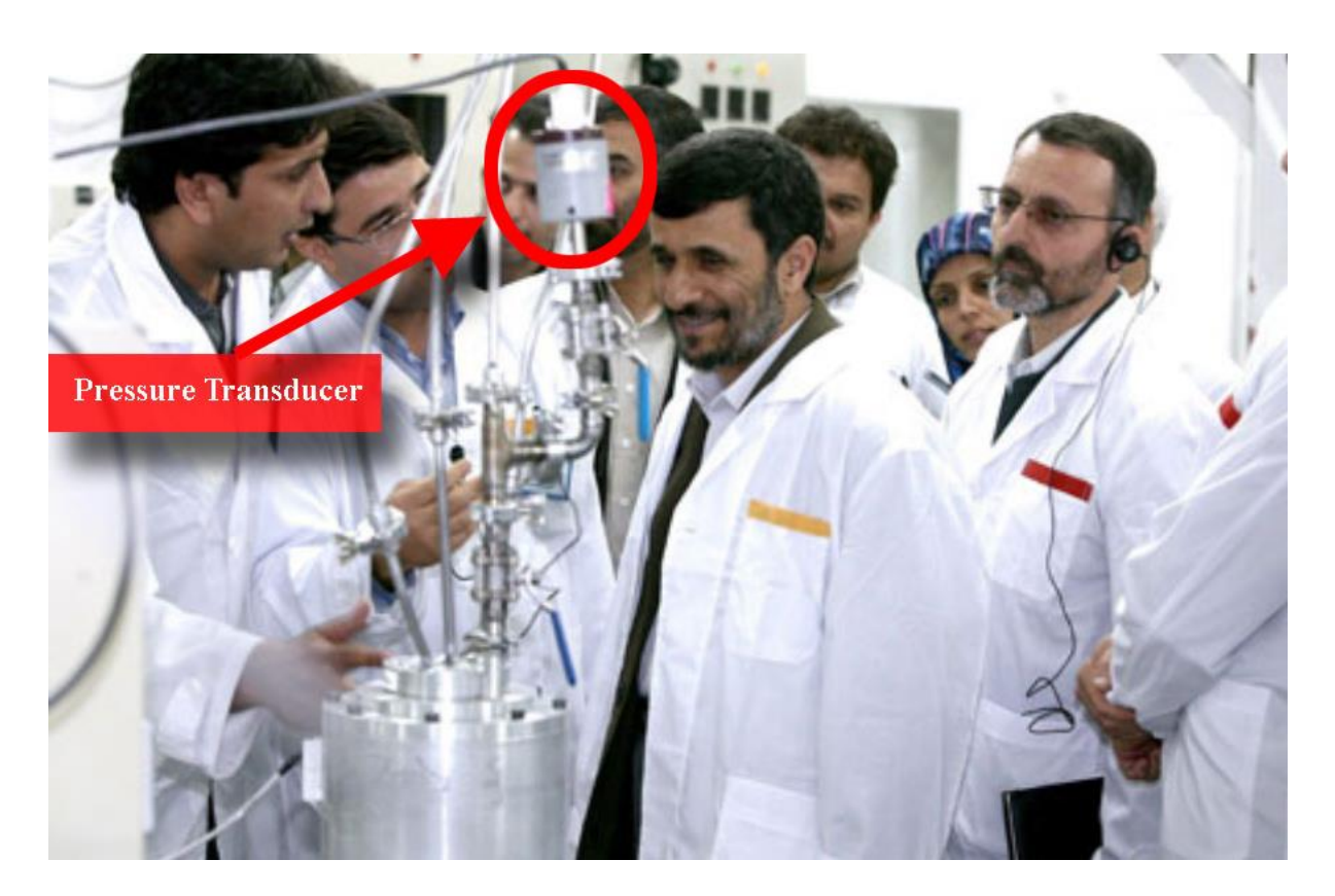
Figure 2: Former Iranian president Mahmoud Ahmadinejad examines an advanced gas centrifuge test stand at the Natanz pilot fuel enrichment plant during a 2008 visit. An MKS pressure transducer can be seen.

The case highlights the need to redouble efforts to counter illicit nuclear trade. Decentralized export compliance too often cannot be effective in preventing proliferation. Instead, manufacturers of proliferation-sensitive technologies must implement compliance systems that ensure that the goods cannot be diverted in the supply chain.