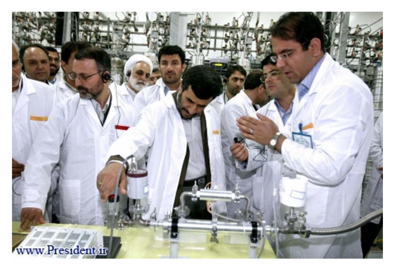
Figure 3: Former President Ahmadinejad examines gas centrifuge equipment, which includes an older MKS pressure transducer (next to his right hand) during a visit to the Natanz pilot fuel enrichment plant in2008. In the background is an IR-1 gas centrifuge cascade which contains many more recent (mid2000s) models of MKS pressure transducers.