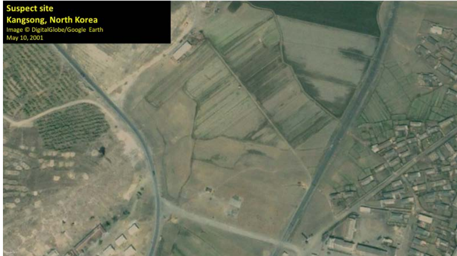
Figure 1. The location of the suspect site in May 2001 before construction started shortly after.

The site appears to have three security regions. One surrounds the building itself, another contains a residential zone next to the plant and some industrial or office buildings, and the third is the outermost security perimeter, enclosing both of the inner ones (see figure 2). A narrow access passage, likely controlled by a security checkpoint, connects the housing area to the plant. It is reasonable to assume that the workers, including technicians and engineers, live in a secure, closed environment. One would assume that, with a project as sensitive as a secret enrichment plant, the workers would be closely monitored and would not be allowed to leave the site without permission. After all, for years, North Korea vehemently denied having a centrifuge program. The site is consistent with a requirement to carefully control the people working at the site.