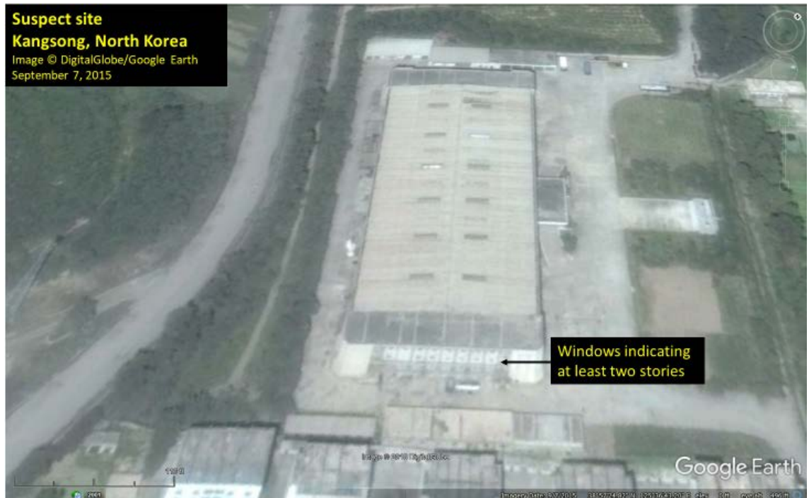
Figure 3. The short back side of the building is visible in a September 2015 image due to the angle at which the satellite photo was taken.

cases. Nonetheless, commercial satellite imagery shows two rows of windows, suggesting that the main hall has at least two floors (see figures 3 and 4). Such a structure is not typical for a Pakistan-type centrifuge plant.