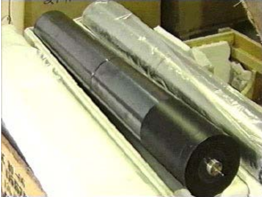
Figure 8. P2 centrifuge rotor assembly in a packing crate.

Another explanation for the frequent presence of trucks could be that the plant failed and had to be rebuilt over the time period of 2009 to 2017, requiring regular deliveries of large numbers of centrifuges and associated equipment, such as piping. Commercial satellite imagery does not show trucks being unloaded, although metal objects and wooden boxes have been seen by governments, which have higher quality and resolution imagery. However, this characterization would conflict with the Yongbyon centrifuge plant being built in 18 months during the start of this time period, with few visible signatures.