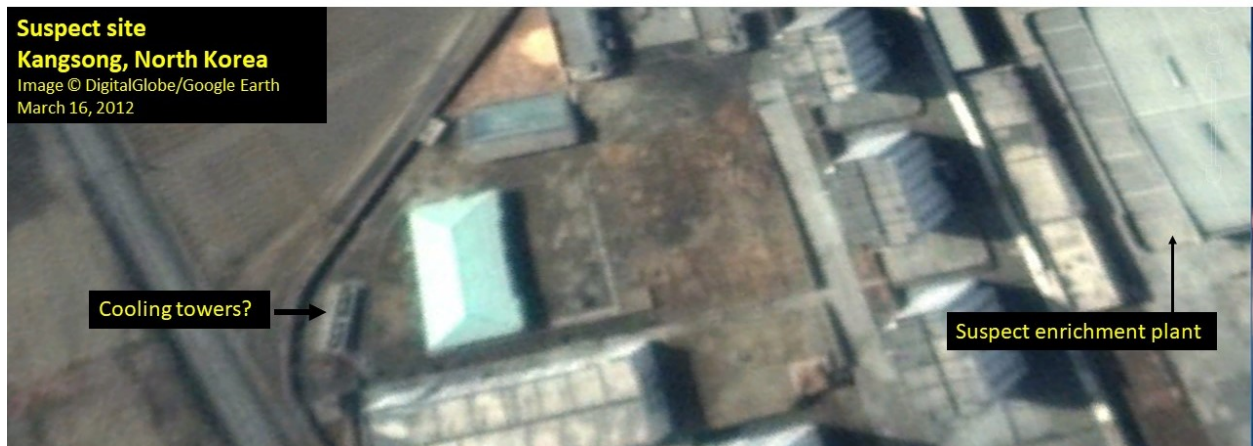
Figure 6. Potential cooling towers can be observed at the suspect Kangsong site, however, their distance from the main building seems rather large. Moreover, evidence of piping could not be found linking these cooling towers with the main building, which is about 100 meters away.

There are some additional anomalies that raise questions about the site's purpose. One is the relatively high frequency of truck traffic around the building that can be seen in commercial satellite imagery (see figure 7). A centrifuge plant this size does not have that many deliveries when it is being operated successfully. For example, it would receive spare parts and cylinders of natural uranium and ship enriched uranium cylinders that would require truck transport, but not as frequently as the visible truck traffic suggests. Moreover, at the Yongbyon centrifuge plant, there is no corresponding level of truck traffic visible in commercial satellite imagery, even accounting for plant size differences.