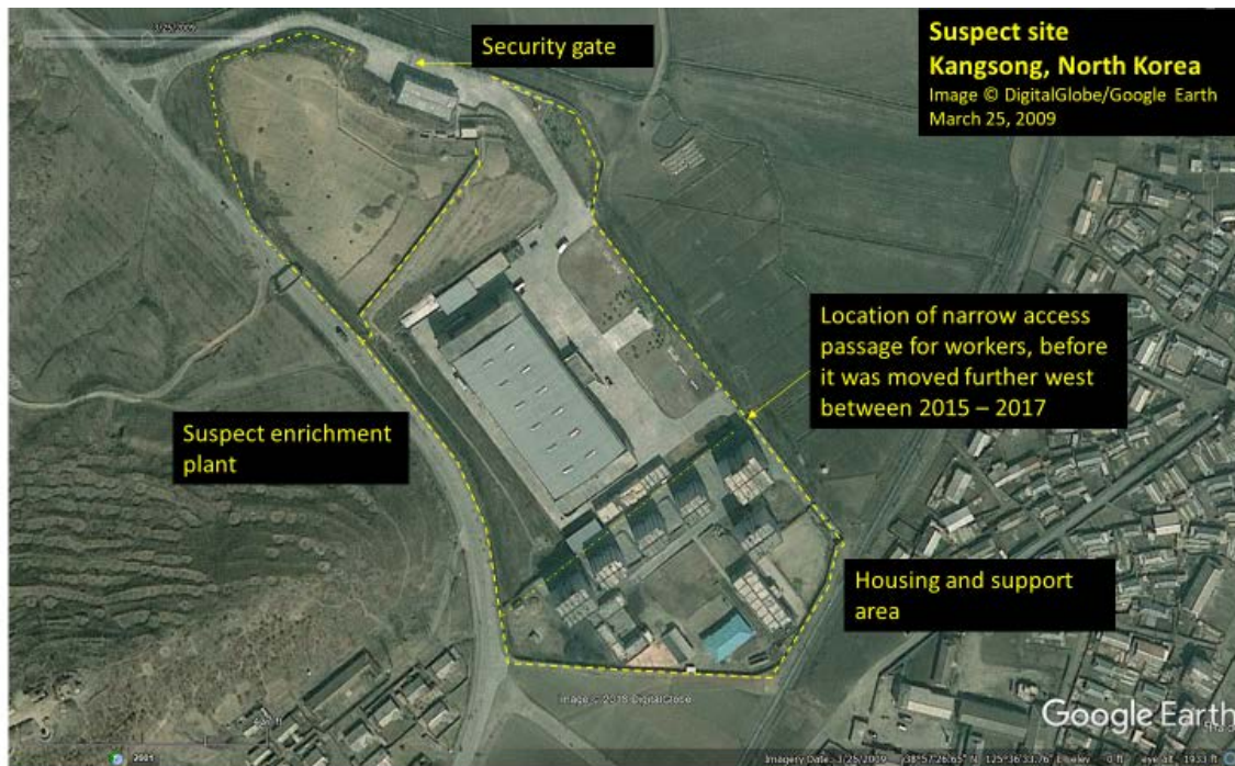
Figure 2. The site appears to have physical security measures consistent with being a secret enrichment plant in an image from March 2009.

The building itself has dimensions of 110 m by 50 m, resulting in an area of 5,500 meters squared. This floor area is not consistent with a one-story plant holding up to 12,000 P2 centrifuges. Some in the intelligence community assert that the plant has this number of centrifuges. This leads to the first anomaly at this site. The internal structure of this building is not known. However, for simplicity, one can start by assuming one floor dedicated to cascades to make low enriched uranium; this gives the maximum density of centrifuges in a Pakistani-style centrifuge plant. Using information about the Yongbyon centrifuge plant and other Pakistani-style centrifuge plant layouts seized in Khan prosecutions, this plant would be expected to hold approximately 5,500 to 6,300 P2 centrifuges, based on a study the Institute did earlier in 2018 when it analyzed Pakistani-style cascade halls. 11 If the plant was designed to make weapon-grade uranium using the four-step Pakistani plant design, this area would hold many fewer centrifuges. 12 It should be noted that if this facility is designed to make only low enriched uranium, there is likely another facility to take this product and further enrich it to weapon-grade.