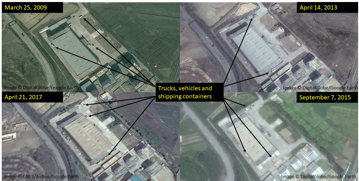
Figure 7. In satellite images taken over several years, consistent truck traffic can be observed at the suspect site. Trucks often appear parked in the entrance area of the site, and also at the back sides of the main building.

During construction, one would expect there to be many truck deliveries. For example, the building does not appear to have facilities to make gas centrifuge components, and manufacturing appears to be done elsewhere. Thus, there would be many deliveries of P2 centrifuge rotor assemblies, piping, and other equipment necessary to outfit and operate a centrifuge plant (see figure 8). However, major truck traffic is still observed after the projected construction period, which is estimated as having occurred in the 2000s. Consistently over the years from 2009 to 2017, where satellite imagery is publicly available on Google Earth, shipping containers, and large and small trucks can be observed around the main building. Large trucks are often stationed at the long back side of the building, and small trucks at the short back side, presumably to unload goods.