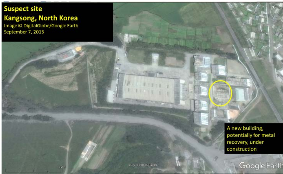
Figure 9. A Google Earth image from September 2015 shows a building under construction.

There is also a new building at the site, near the residential area. It could be for metal recovery (see figure 9).