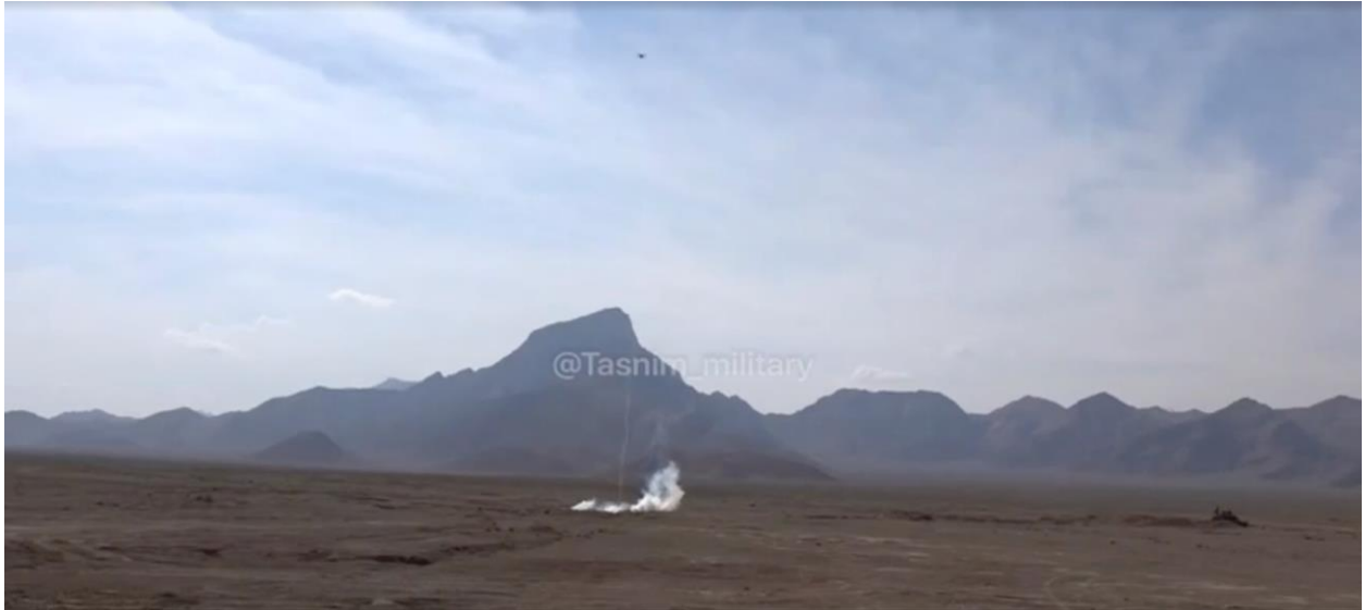
Figure 7. A screenshot of the drone operation video. The drone is visible in the sky firing rounds of smoke grenades.