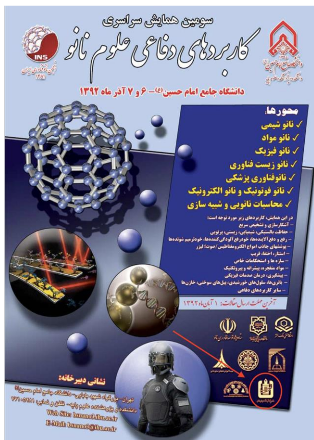
Figure 3. The poster for the 3rd National Conference on Defensive Applications of Nanoscience. You can see the SPND logo in the bottom right corner.