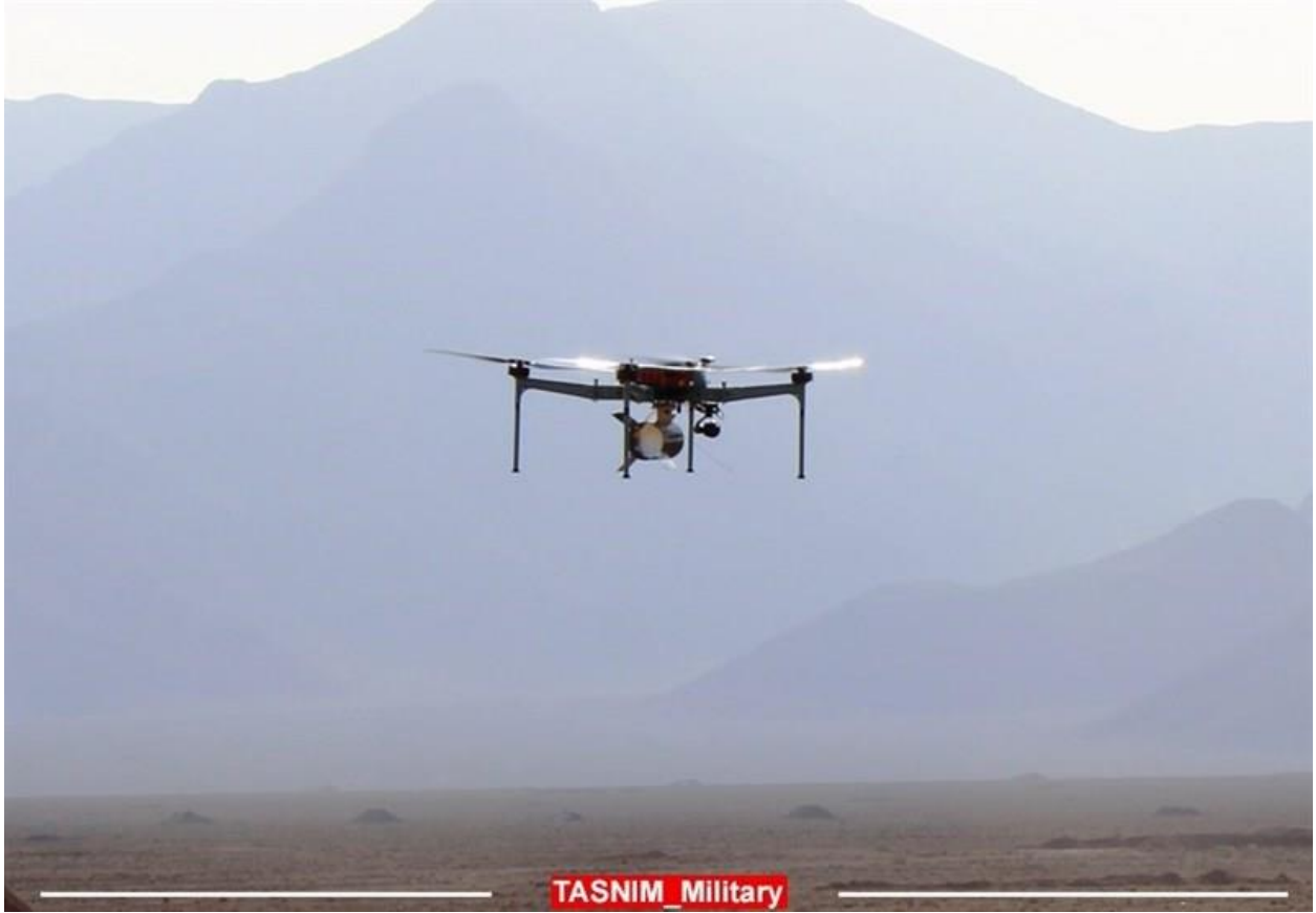
Figure 6. A close up look at the IRGC’s multirotor bomber.