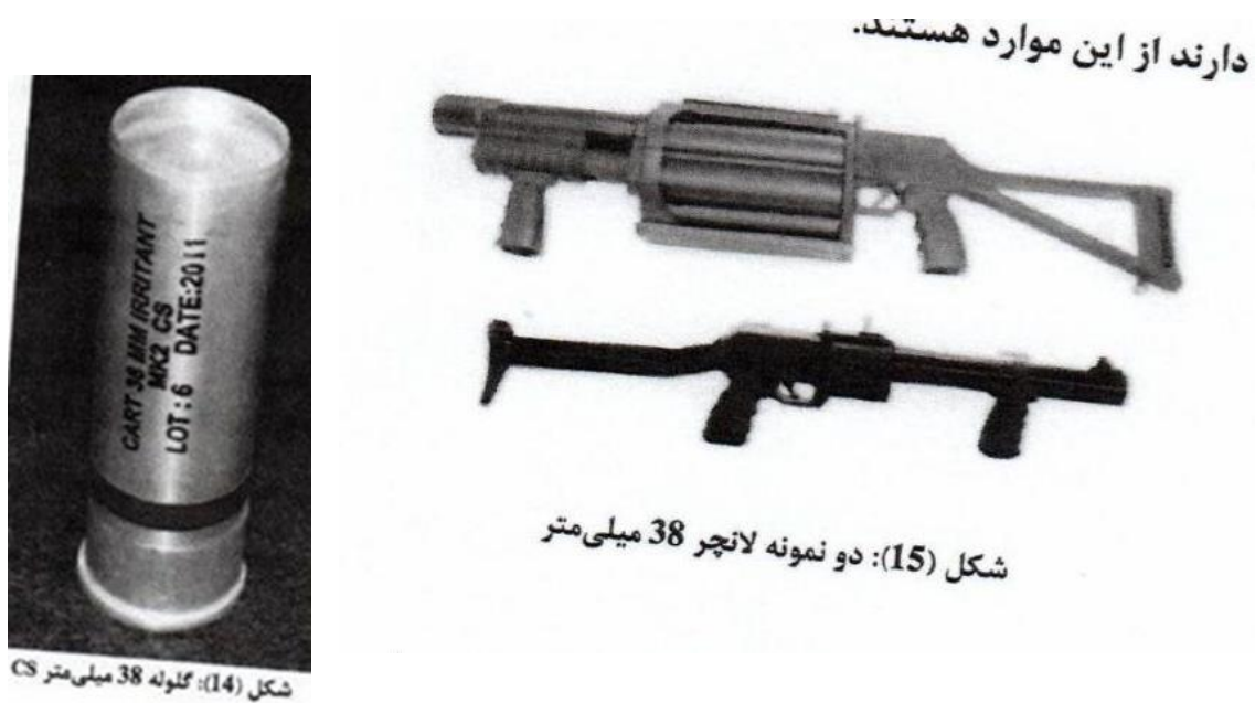
Figure 2. 38mm MK 2 (left) and its launcher (right).

Table 1, translated from the hacked documents, shows the formulation of the various 18g chemical fillers tested in a hand grenade by the IRGC. Potassium perchlorate, lactose, silica, aluminum oxide, binder, and tartaric acid together are supporting agents used to produce heat, combustion, and smoke of the propellant formulation. According to the table, different pyrotechnic mixtures have been tested to ensure reliability and effectiveness of the grenade in parameters such as burn rate, smoke volume, duration, and dispersion. Finally, the M6-40% formulation introduces medetomidine hydrochloride as the incapacitating agent which composes 40 percent of the filler mixture. The common riot-control rounds have a similar composition but the incapacitating agent in them is 2-chlorobenzalmalononitrile also known as CS gas.