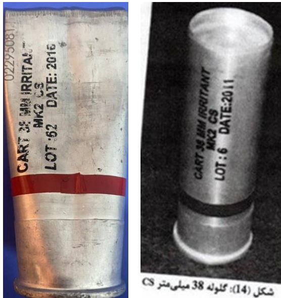
Figure 5. The empty shell used against civilians in Iran, uploaded by an anonymous account on X 37 (left) next to the picture of the cartridge used for medetomidine delivery by IRGC from the hacked documents (right).