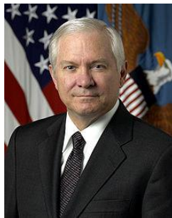
Official portrait of Robert Gates

The export control reforms announced in 2010 by then Secretary of Defense Gates outlined a plan to repair deficiencies and streamline the export control system by creating “four singles” – a single control list, a single licensing agency, a single export law enforcement agency, and a single IT platform. 22 The initiative was to occur in three phases. Phases I and II could be enacted by executive action, but Phase III would require Congressional legislation to complete.