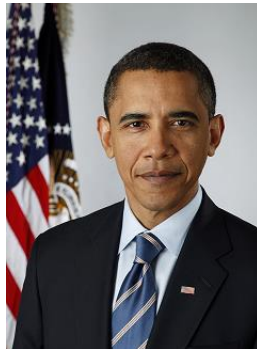
Official portrait of Barack Obama

In August 2009, President Obama authorized an interagency task force at the National Security Council to conduct a review of the U.S. export control system. The effort included an Intelligence Community assessment about U.S. national security goals in the context of controlling the spread of proliferation-sensitive goods and technologies. In April 2010, former Defense Secretary Robert Gates announced the preliminary results of the review and steps to be taken under an official Export Control Reform (ECR) Initiative. Among the administration's goals of the ECR Initiative were to: introduce practical reforms to what it viewed as an archaic and overly complex U.S. export control system, including an effort to streamline the licensing of exports; increase U.S. economic competitiveness by reducing perceived overregulation, particularly on military goods and spare parts; promote ease of transactions and trade with U.S. allies; harmonize information technology (IT) systems; lower costs and administrative burdens on government and industry overall; reduce redundancies among and increase coordination of export control enforcement agencies; and strengthen nonproliferation efforts by allowing the government to focus more attention on the most critical proliferation-relevant transactions. 1