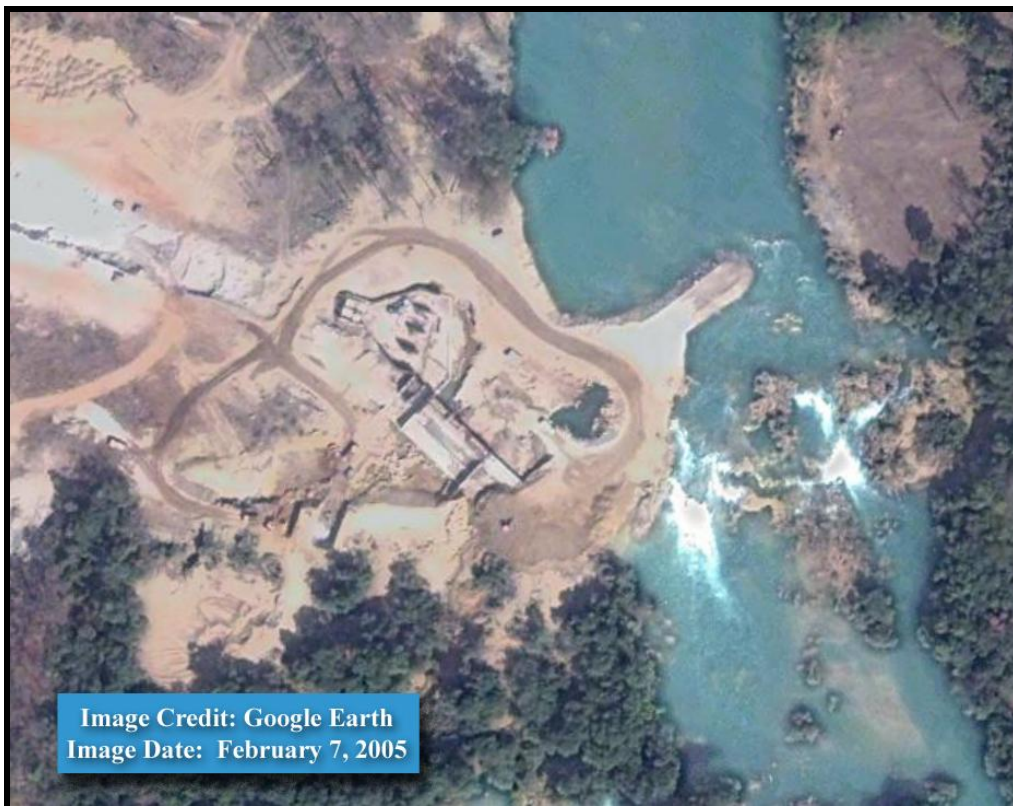
Figure 2. Example of dam construction located in Burma at 20.598385, 98.292722.