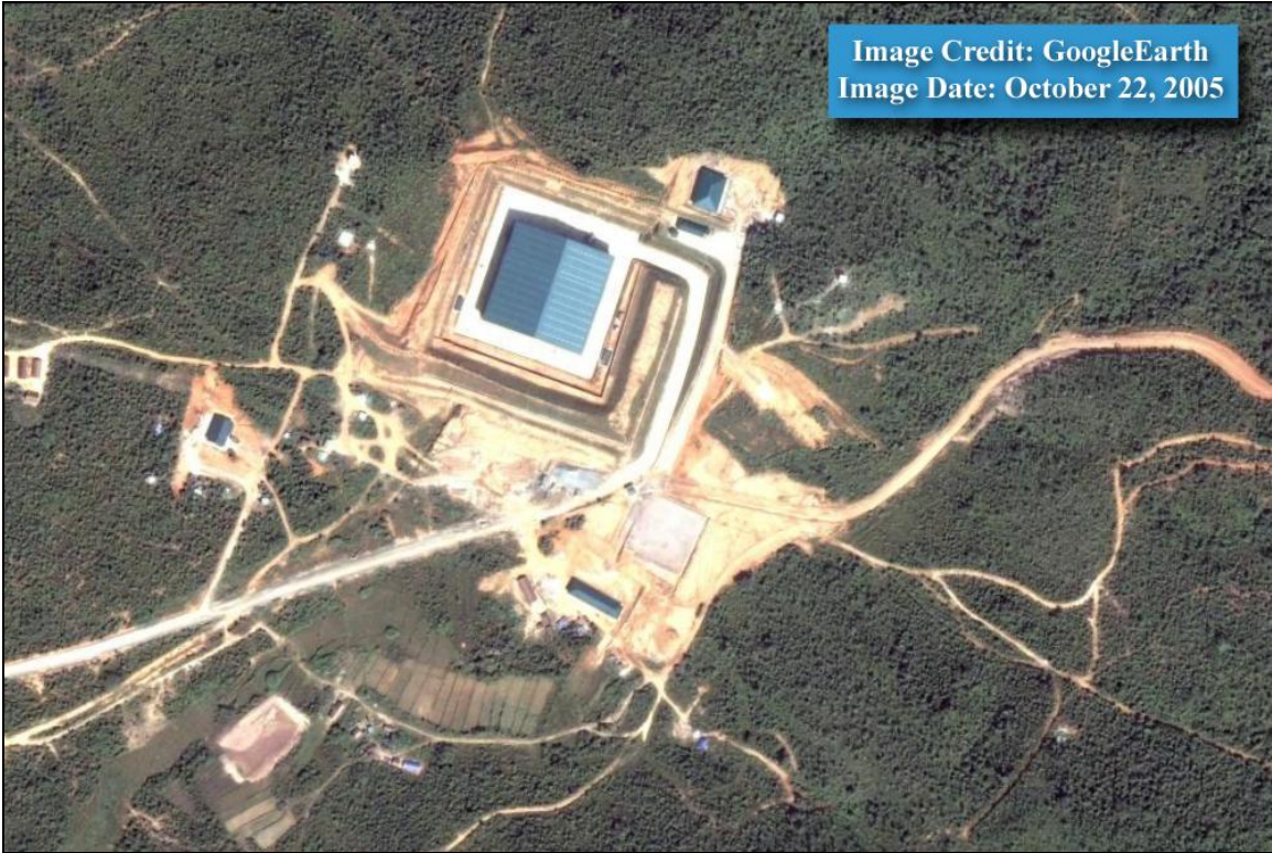
Figure 5. Anomalous building buried in the ground north-east of Maymyo, Burma at 22.05084, 96.62954.