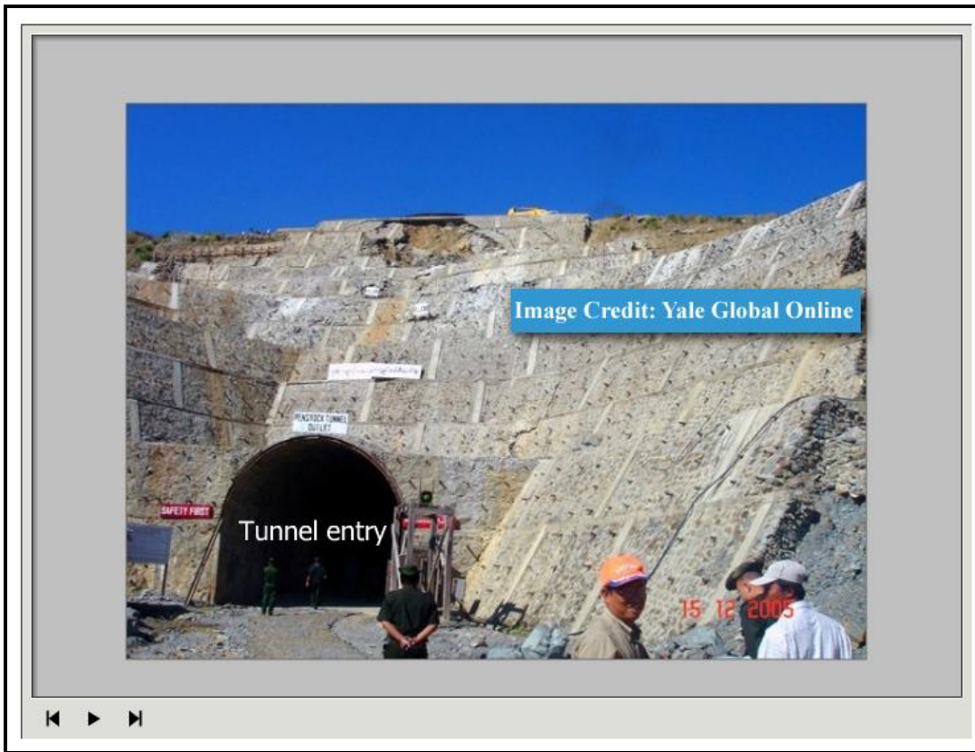
Figure 1. Ground photograph obtained by Bertil Lintner at YaleGlobal Online. ISIS assessed that this photograph depicts a dam penstock.