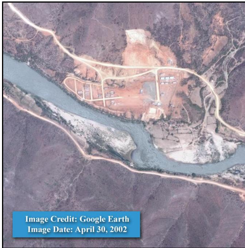
Figure 3. Another example of dam construction. Yeywa dam construction project in Burma at: 21.68724, 96.42698