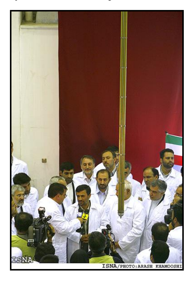
Figure 1. Iran's President Ahmadinejad examining a fuel rod bundle at the Fuel Manufacturing Plant at Esfahan.

In figure 1, President Ahmadinejad is examining the lower end of a fuel rod bundle that appears visually identical in every way to an RBMK fuel bundle of 18 pins, spacers, end caps, etc. Judging by the height of the people, this is a 3.5 m long fuel rod bundle and not a fuel cell. The suspension is about 4 meters long.