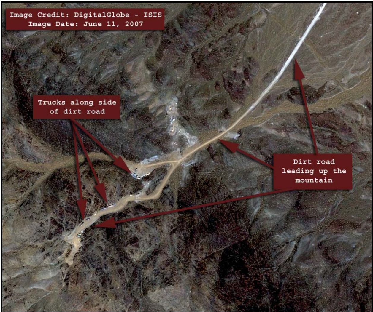
Figure 3. This new road construction could be for building a second tunnel entrance. The tunnel complex in a mountain adjacent to the Esfahan Uranium Conversion facility has multiple entrances.