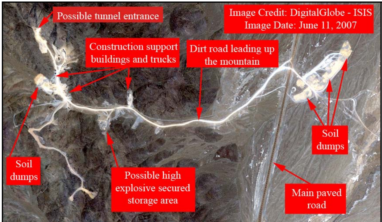
Figure 2. Construction activity appears related to the building of a tunnel complex. Soil and rock dumps are identifiable. Tunnel entrances are not visible, but they could be at or near the end the end of the road in the upper left section of the image. A fenced, apparently secured area, is visible adjacent to the road just past the first set of construction support buildings. This area could store high explosives used in tunneling.