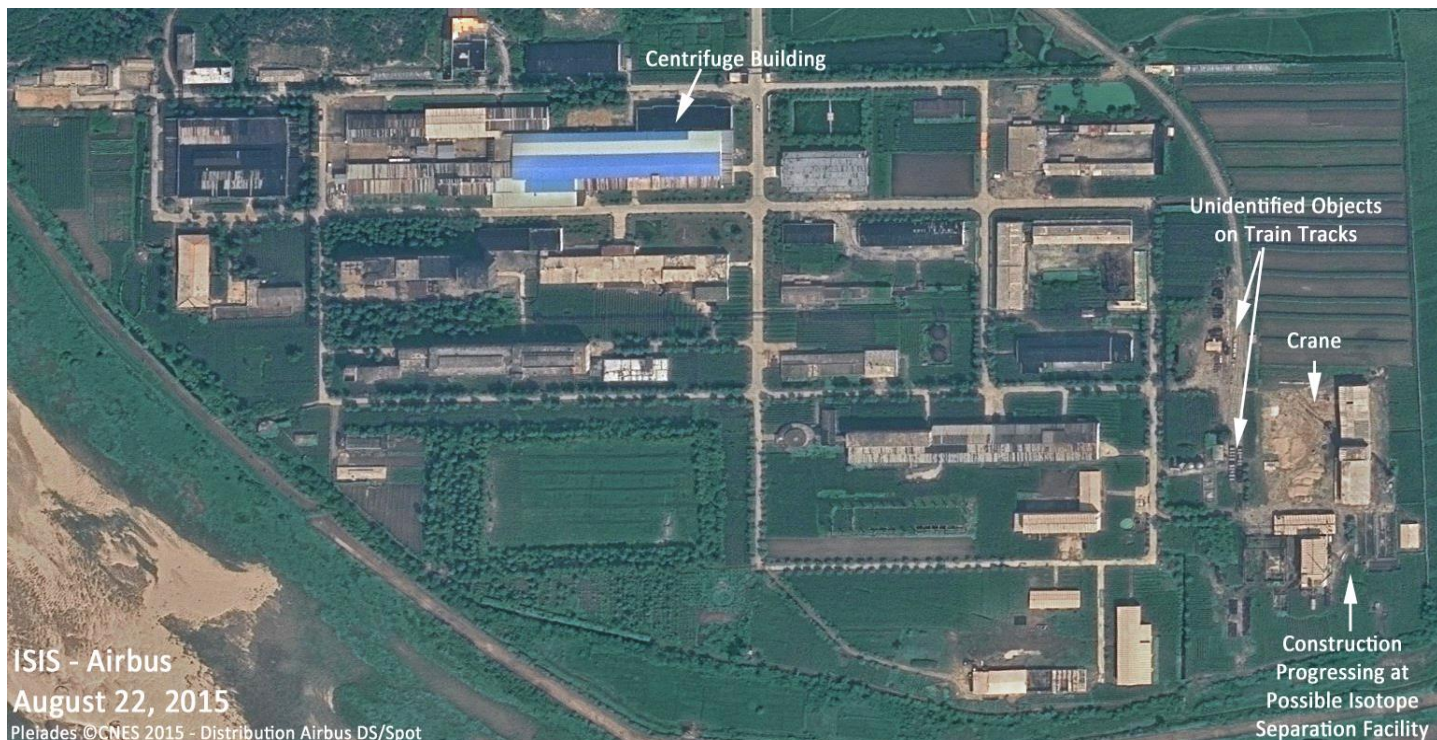
Figure 1. Airbus imagery showing the status of North Korea's Yongbyon Fuel Fabrication Complex on August 22, 2015.