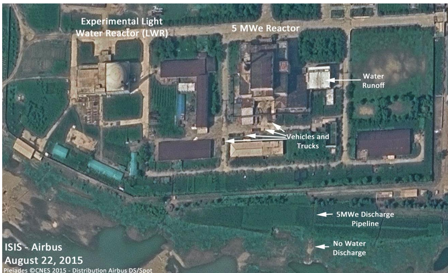
Figure 2. Airbus imagery showing North Korea's Yongbyon 5 megawatt-electric and experimental light water reactors on August 22, 2015.