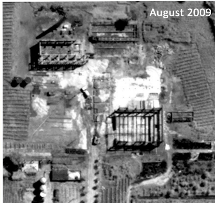
Figure 3. Google Earth/DigitalGlobe/Airbus imagery showing the demolition of the existing buildings east of the fuel fabrication complex between 2002 and 2009.