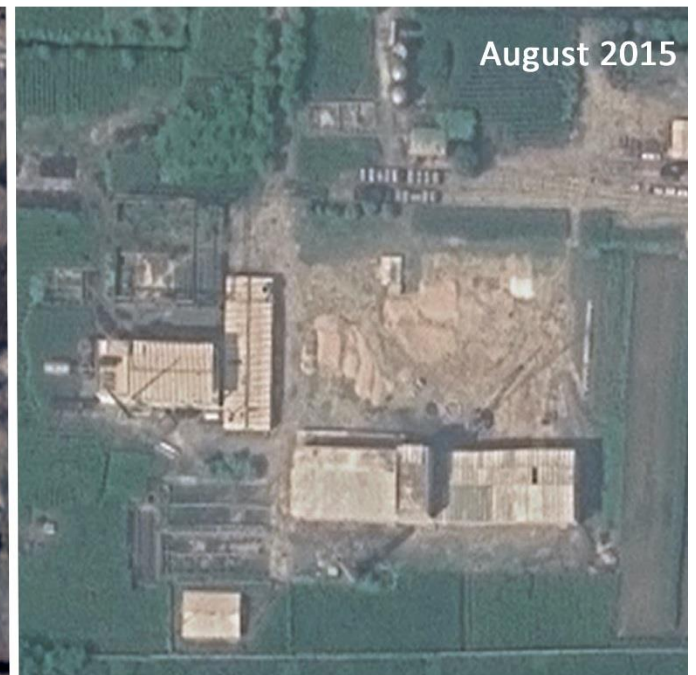
Figure 4. Google Earth/DigitalGlobe/Airbus imagery showing the construction activities east of the fuel fabrication complex between 2010 and 2015.