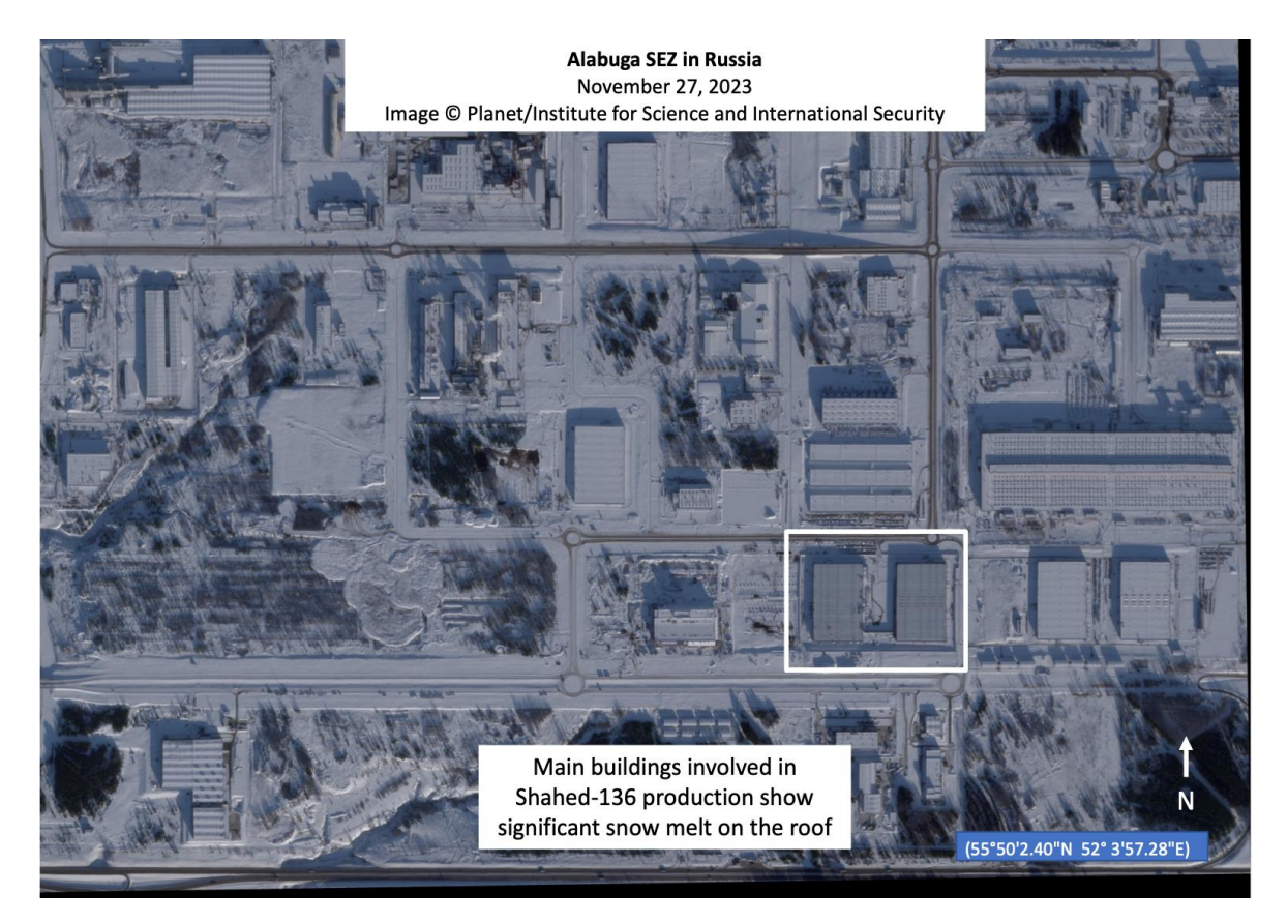
Figure 1. Location of the two main buildings used for Shahed-136 production inside the Alabuga SEZ. All other buildings in the vicinity have significantly more snow cover on their roofs.

Further, construction activities are visible in the open field west of the security perimeter wall enclosing buildings 8.1 and 8.2. This area was leveled in 2021 when buildings 8.1 and 8.2 were constructed, but used as a construction dump site until at least May 2022. Sometime between May 2022 and July 2023 the site was cleared, and as of July 2023 the wet areas were being filled with dirt. As of late November, tire tracks and dirt mounds visible in the snow indicate ongoing construction in this area. Multiple parallel rows of pillars are visible, likely for one or two buildings with a combined floor space similar to building 8.2. The immediate adjacency of this construction to the drone production site, no apparent shortage of usable plot at the Alabuga SEZ, and the relatively large remaining gap in the security wall on the southwest corner raise the question whether the new construction is related to the drone production buildings, such as having a supportive function (providing additional utilities, parts/materials warehousing, etc.)