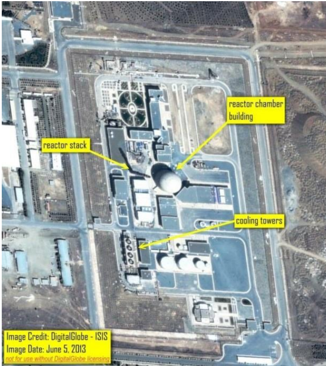
Figure 1. Arak IR-40 Heavy Water Reactor