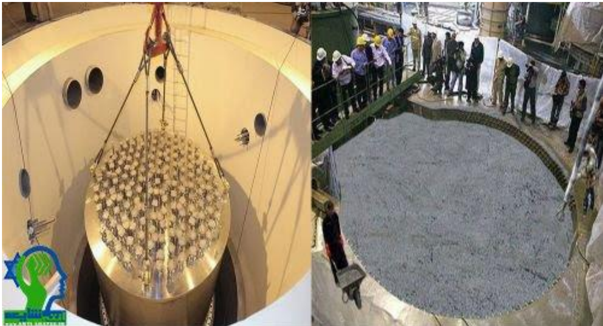
Figure 3. Photos of the Arak plutonium reactor compared to a Photoshopped version.