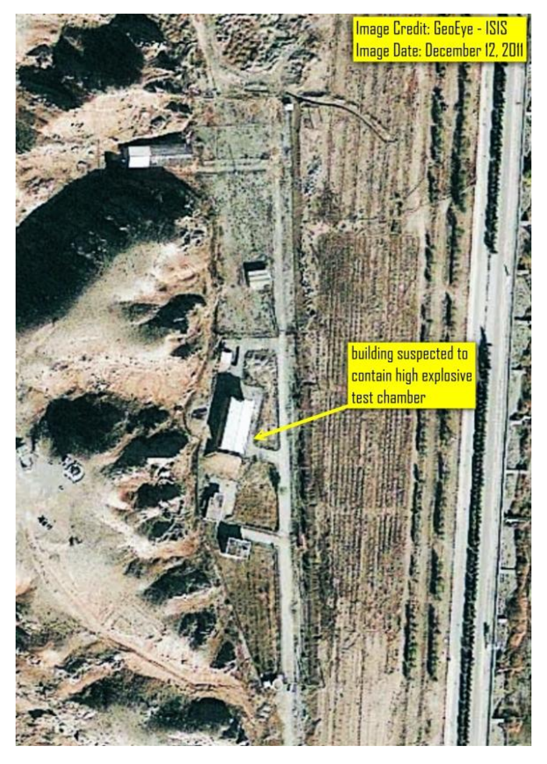
Figure 4. Imagery from December 12, 2011 showing the original buildings, security perimeter and layout of the Parchin site prior to the February 2012 IAEA request to access the site. Following the IAEA request Iran initiated work that resulted in the complete alteration of the internal layout, modification and demolition of several buildings and construction of a new security perimeter.