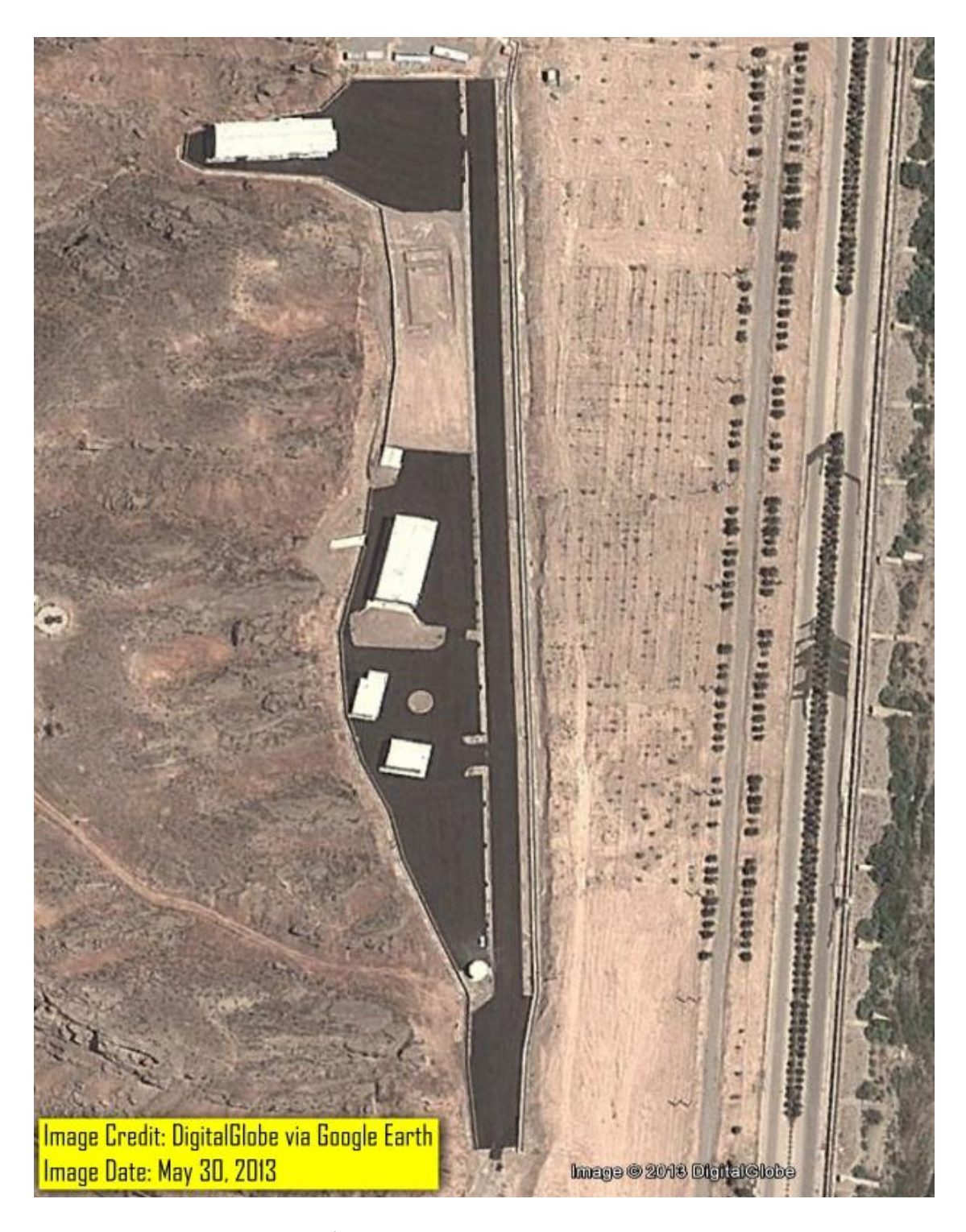
Figure 3. DigitalGlobe imagery from May 30, 2013 available on Google Earth showing the site conditions at the end of the first phase of asphalting.