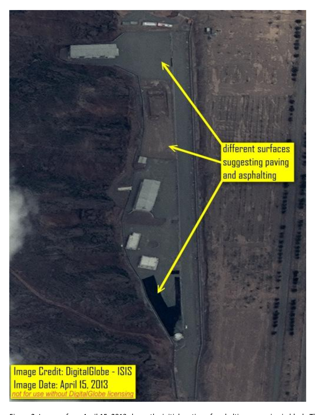
Figure 2. Imagery from April 15, 2013 shows the initial section of asphalting appearing in black. The gray surfaces indicate ground that has been prepared for asphalting, while a section between the two major buildings appears to have a different color and texture, indicating that it has not been readied for asphalting.