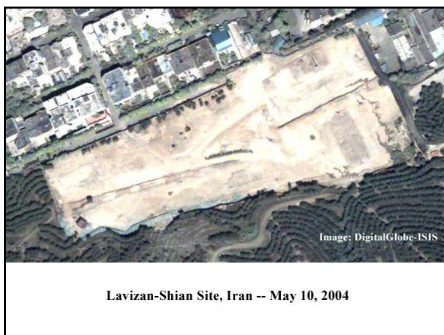
Figure 2. May 10, 2004 satellite image showing the site razed.