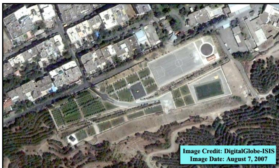
Figure 3. August 7, 2007 satellite image showing a park and athletic fields present on the site.