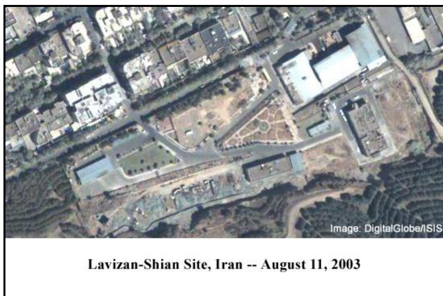
Figure 1. August 11, 2003 satellite image of the Lavizan site, the location of the Physics Research Center.