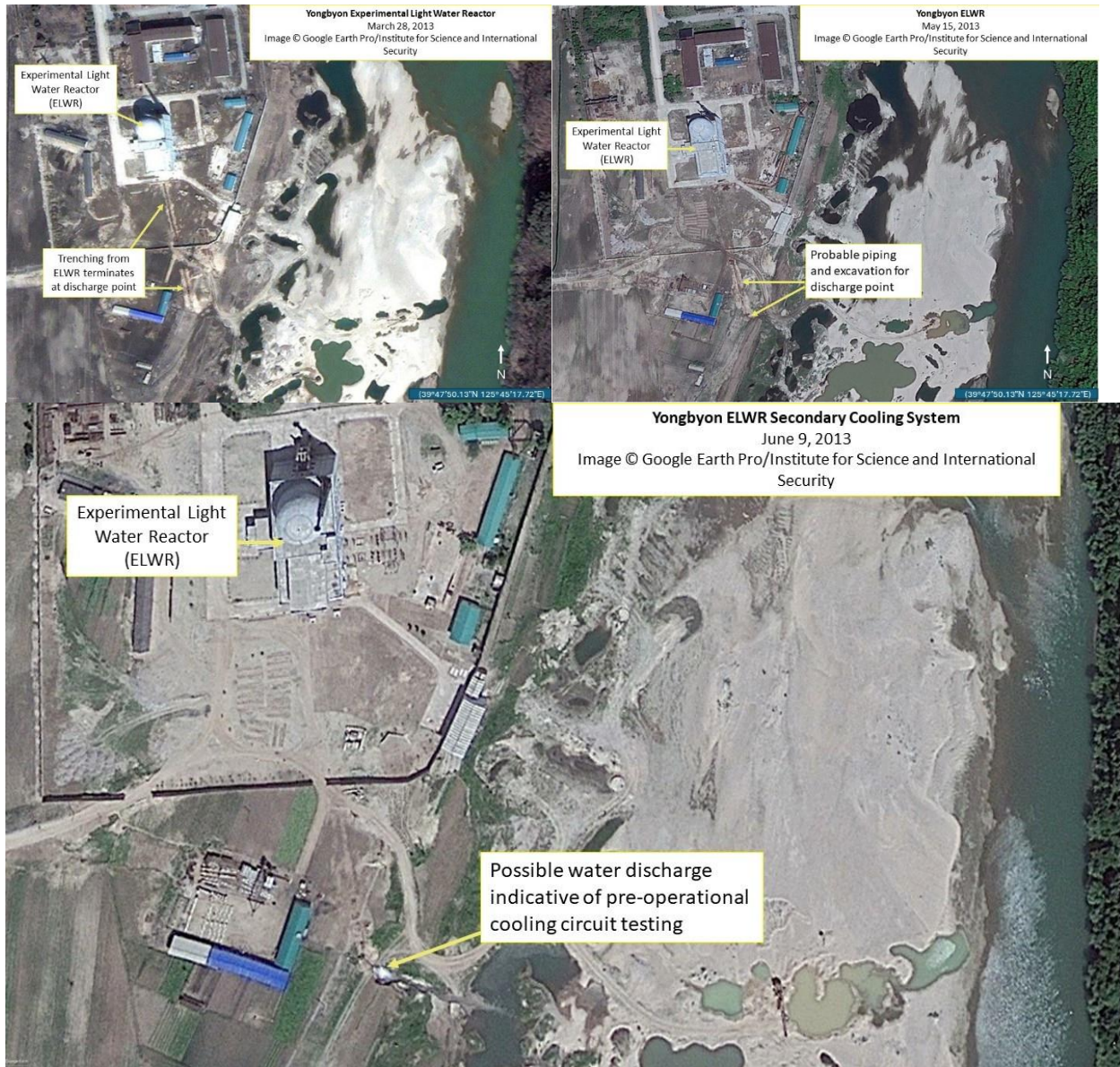
Figure 4. Trenching and excavation activities in 2013 show that the water discharge point is directly connected to the ELWR.

According to the 2022 annual IAEA safeguards report on North Korea, recent testing of the cooling water system could have taken place in July 2022. 2 However, imagery reviewed dating to July 14, 22, 26, 28, and 30 did not show visible water discharge at the discharge point. The July 22, 2022, image appears to show some water outflow into the river from a discharge point nearby, but this discharge point is notably smaller and farther upstream than the current discharge point. The UN Panel of Experts on North Korea reports possible testing on February 27, 2023, March 7, 2023, and April 12, 2023, but also points to the smaller discharge point