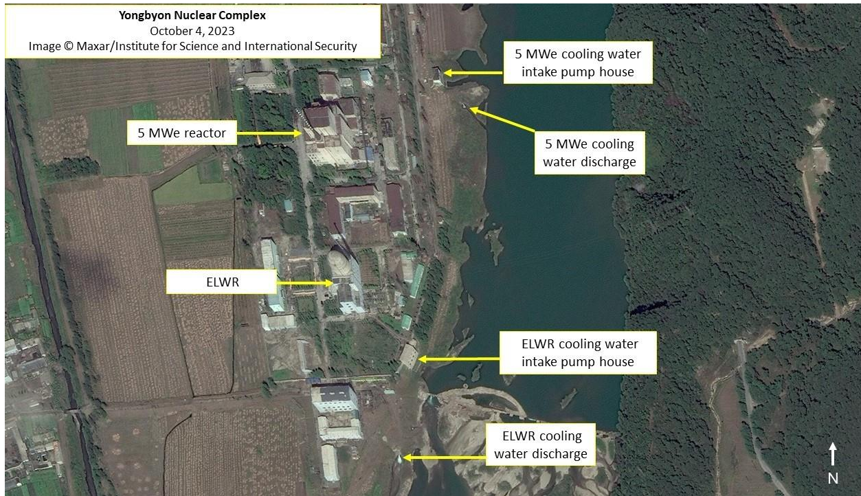
Figure 1. A significant amount of water discharge from the ELWR was first visible publicly in early October 2023 commercial satellite imagery and has been visible regularly since.

While the water outflow is consistently visible, the amount of outflowing water does not appear to have been consistent in volume, with some dates showing water gushing out of the discharge point in a wide stream, and others showing a thinner stream, albeit still significant. The widest water stream was noted on December 10, 2023 (see Figure 2). Imagery from just ten days later on December 20, 2023, shows an outflow that is half as wide.