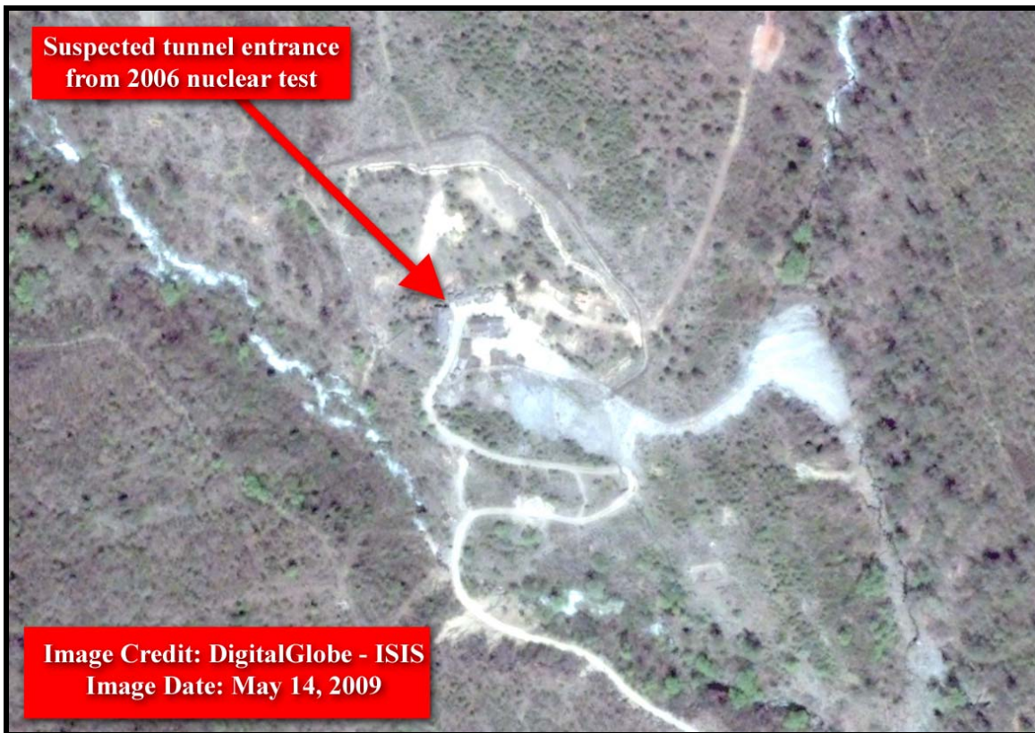
Figure 3. May 14, 2009 image of the suspected tunnel entrance for the 2006 nuclear test in North Korea. This site is approximately 5.5 kilometers from the center point coordinates of the 2009 event from the USGS.