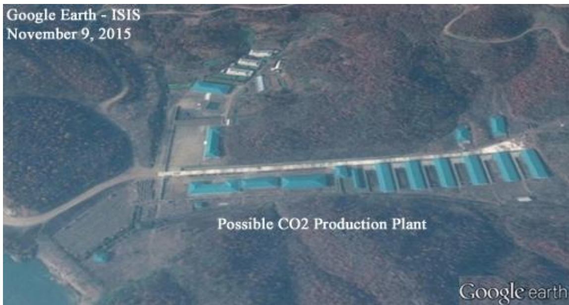
Figure 4. Google Earth imagery showing the possible location of North Korea's CO 2 production plant.