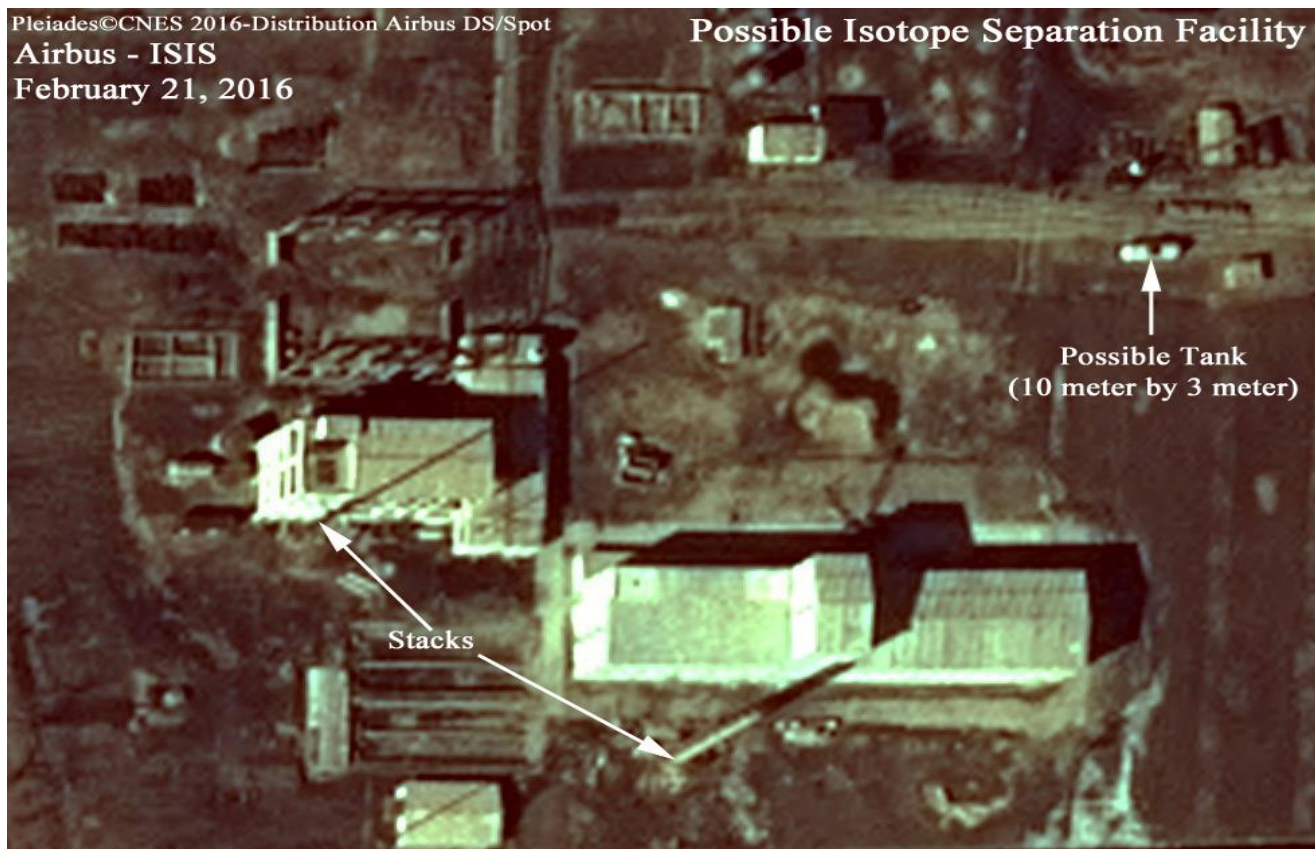
Figure 5. Airbus imagery showing the status of North Korea's possible Isotope Separation Facility on February 21, 2016.