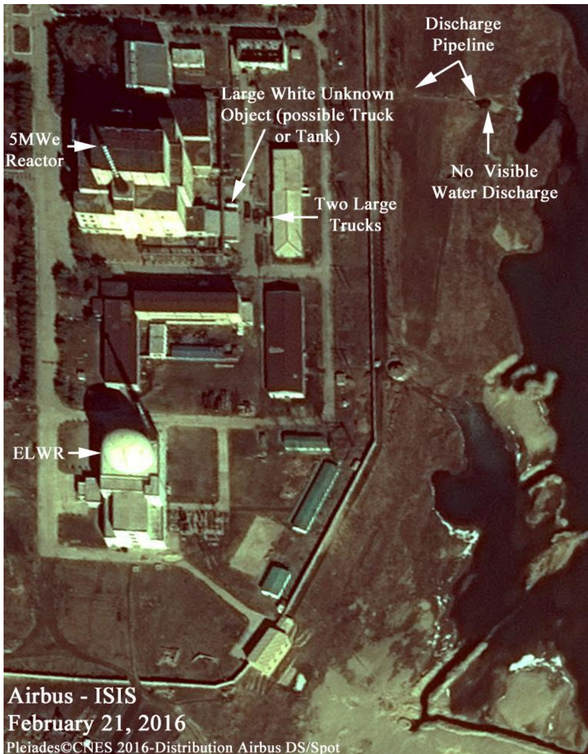
Figure 1. Airbus imagery showing the status of North Korea's 5 MWe and ELWR reactors on February 21, 2016.