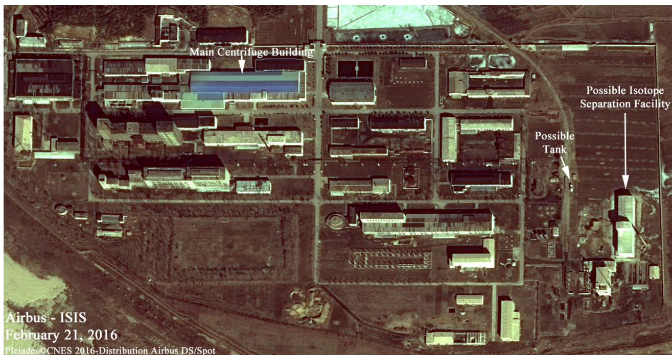
Figure 6. Airbus imagery showing the status of North Korea's Fuel Fabrication Facility and possible Isotope Separation Facility on February 21, 2016.