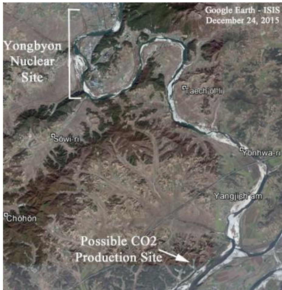
Figure 3. Google Earth imagery showing the possible location of North Korea's CO 2 production plant in reference to the Yongbyon Nuclear Site.