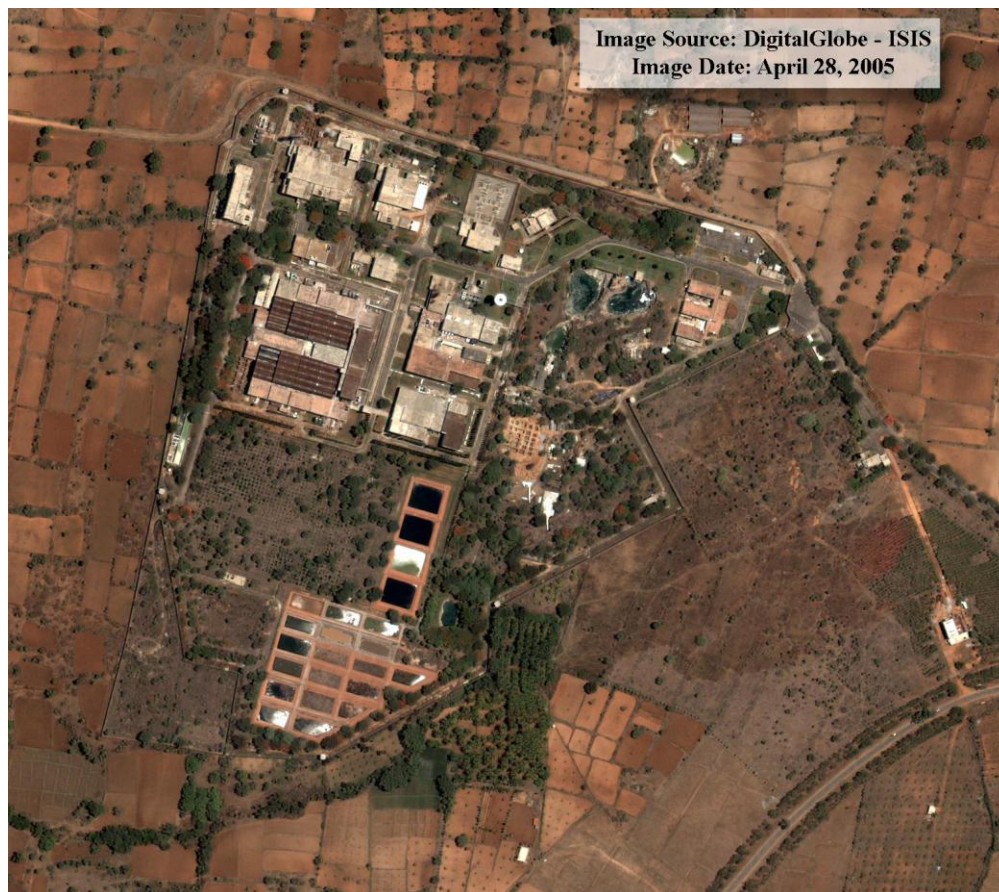
Figure 2. April 28, 2005 DigitalGlobe satellite image of Rare Materials Plant (RMP) in India.