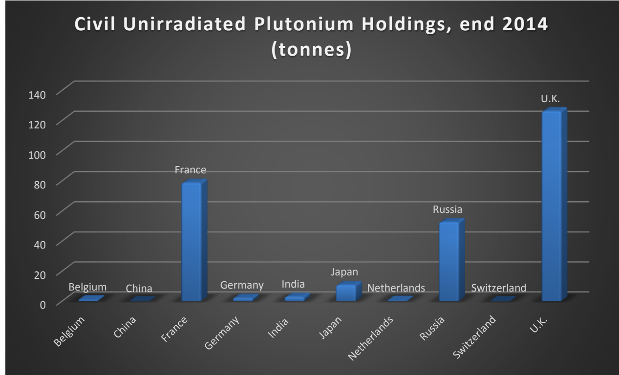
Figure 1. Civil Unirradiated Plutonium Holdings, end of 2014.<sup>5</sup>

Of this total amount, about 275 tonnes of plutonium, or about 12 percent, were in the more dangerous unirradiated forms in approximately 10 countries (see figure 1). Figure 2 shows the growth in the unirradiated plutonium inventory in power reactor programs.<sup>4</sup> From 1996 to 2005, the world's stock of civil unirradiated plutonium in civil programs grew at an average rate of about 10 tonnes per year. From 2005 to the end of 2014, the average growth rate has slowed to about two tonnes per year.