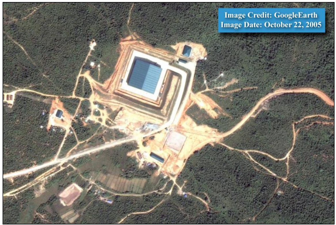
Figure 5. Anomalous building buried in the ground north-east of Maymyo, Burma at 22.05084, 96.62954.