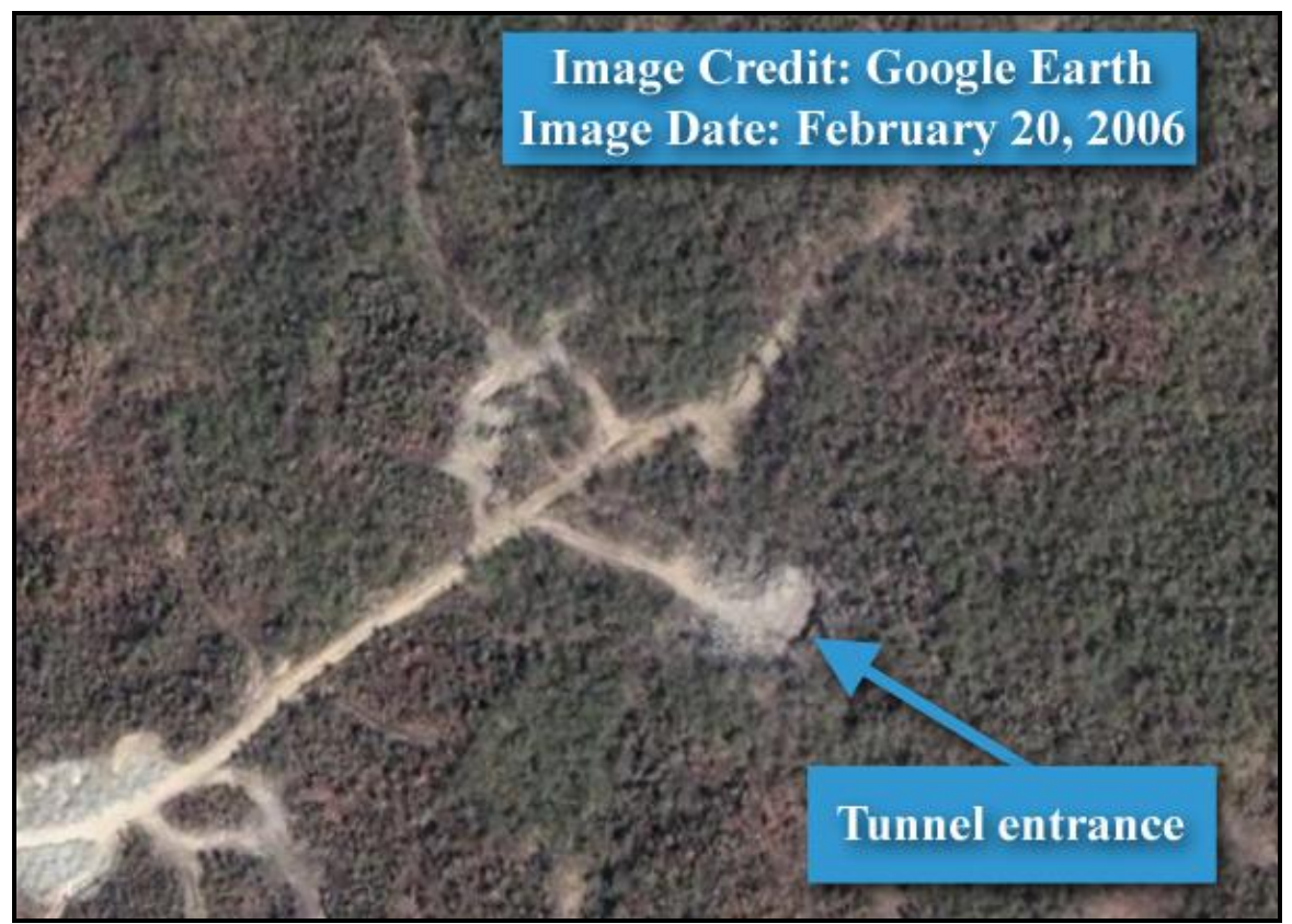
Figure 4. Example of a tunnel entrance near the military town of Nay Pyi Daw, Burma.