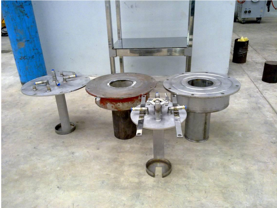
Figure 1: Bomb Reactors

Enough suspicions remain about the Burmese regime's ambitions that more scrutiny is needed. This scrutiny needs careful balancing and a thorough review. Otherwise, important information risks being discarded or devalued, diverting necessary and sustained attention that the nuclear intentions of the Burmese regime deserve.