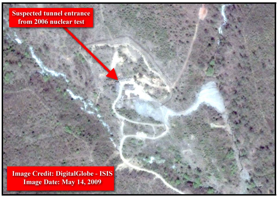
Figure 3. May 14, 2009 image of the suspected tunnel entrance for the 2006 nuclear test in North Korea. This site is approximately 5.5 kilometers from the center point coordinates of the 2009 event from the USGS.